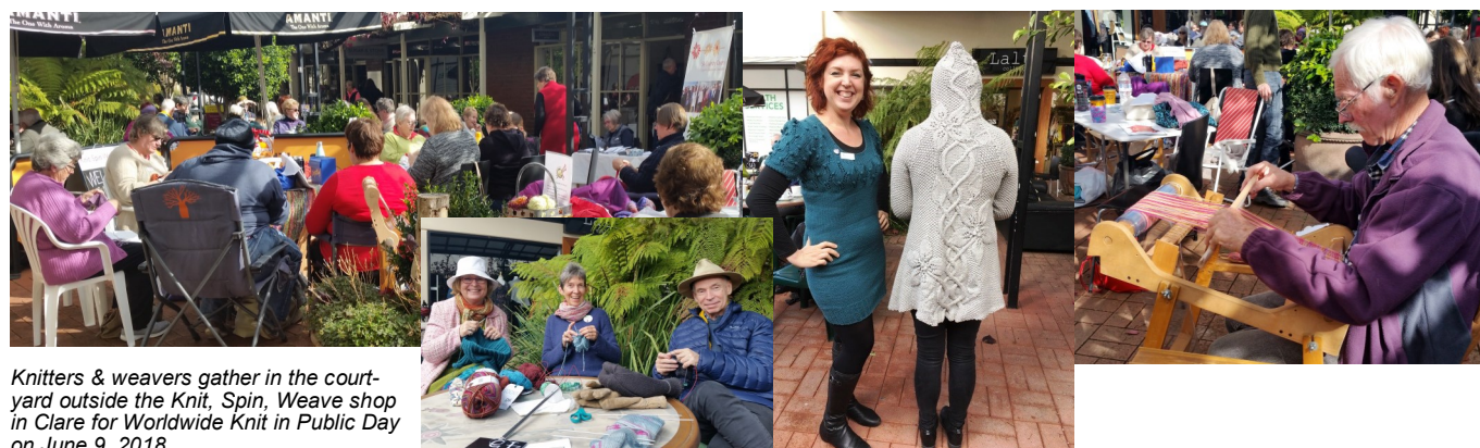
Knitters & weavers gather in the courtyard outside the Knit, Spin, Weave shop in Clare for Worldwide Knit in Public Day on June 9, 2018

There were other sock knitters but also people who were far more adventurous – check out the dress and coat that two young women had knitted. I don’t think I have the skills or the time! People came from far and wide and it was a lovely event. Keep an eye out for the event in 2019 and remember that some of the best knitters in the world are men!