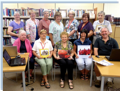
HOOKED ON SNAPPFISH

So, if inside your 'Inbox' My Grandma you should see Please 'Copy, Scan' and 'Paste' her And send her back to me.