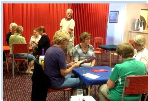
BRIDGE FOR BEGINNERS